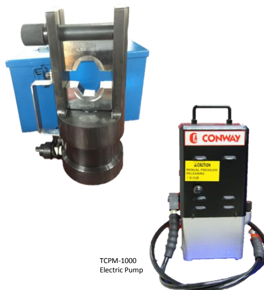
TCPM-1000 Electric Pump