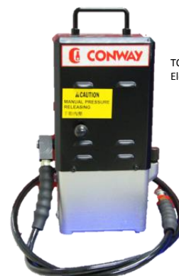
TCPM-1000 Electric Pump